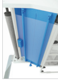
Splicing table (more options) 14