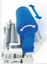
Shaft-less unwind 18