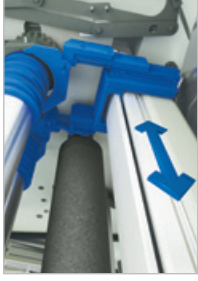
Automatic knife/blade positioning system 13