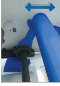
Unwinding tension control 21