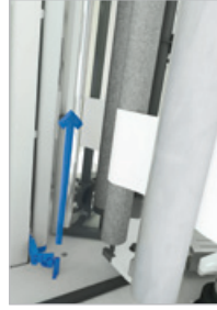
Automatic cross slitting 24