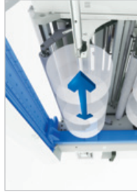
Unloading system 09