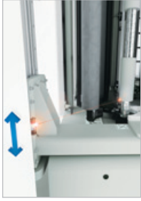
Automatic laser core guiding 08