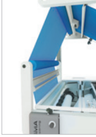
Overhead web path 22